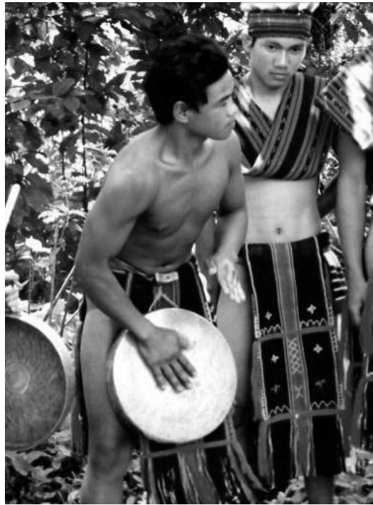
Figure 4: SLT Performance group in Kiangang