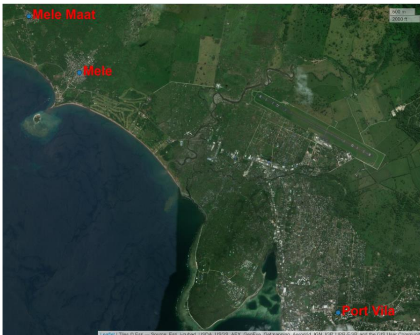
Figure 4: Map of Efate island showing Mele Maat and Mele outside Port Vila

established by various payments and custom ceremonies, there are still conflicts over land rights both within Mele Maat and with adjacent Mele village (Johansen 2012). Mele Maat residents also retained their rights to land around Maat on Ambrym, which has been continually occupied by relatives on the island (Tonkinson 1968: 270).