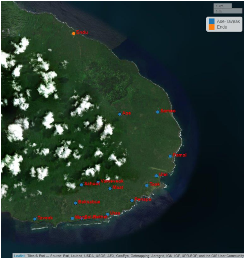
Figure 3: Map of Southeast Ambrym showing Endu and Ase-Taveak villages

Vatlongos is also spoken by the Mele Maat community, outside the capital of Vanuatu, Port Vila, on Efate Island (see Figure 1, Figure 4). This community relocated from Maat village, Ambrym, following a volcanic explosion in 1951. In the aftermath of the disaster, Elder Solomon and Chief David, leaders in Maat village, arranged for their community to work for a French trader on a plantation near Port Vila. The Maat community therefore founded a new village, combining the name of their village on Ambrym with the closest neighbouring village on Efate, Mele. The arrangement was a success and was gradually formalised as a permanent resettlement. Tonkinson (1968) gives a detailed history of these decisions and the progress of the new community in its first fifteen years. Rosie Obed describes her memories of the disaster and the relocation in a contribution to this project [20141117a_n01m003]. Although the rights of the Mele Maat community are in theory well