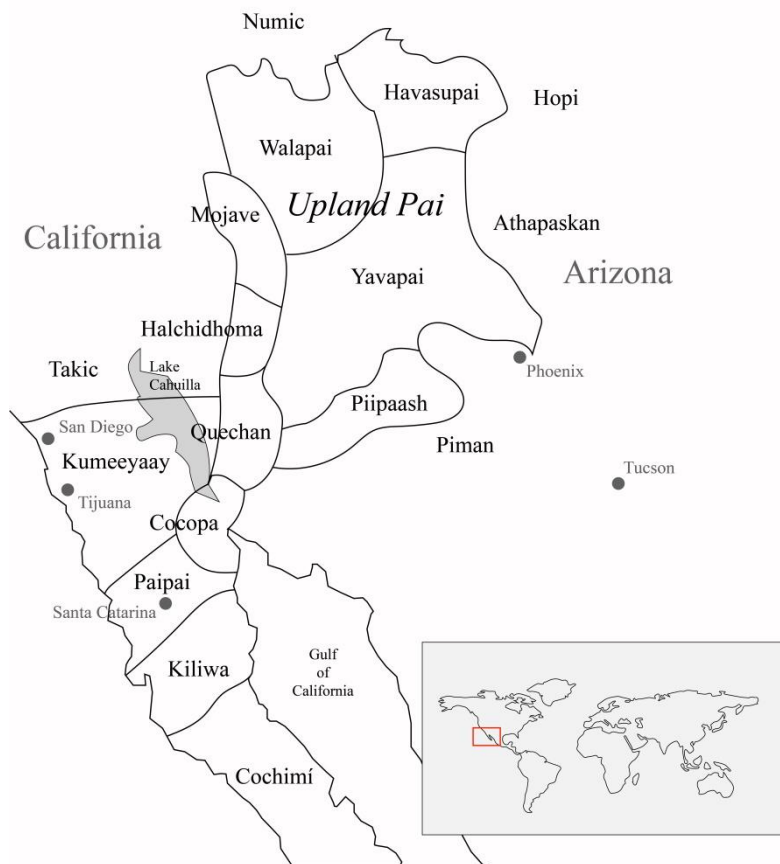
Figure 2. Traditional territories of Yuman groups 4

According to Mexico's National Indigenous Languages Institute (INALI), the Paipai language is spoken in 32 different localities, in which the municipality of Ensenada is included (INALI 2012). Most speakers live in the indigenous communities of San Isidoro and Santa Catarina, the latter having the highest number of both population and Paipai speakers. Santa Catarina is located in Baja California, Mexico (see Figure 2), approximately a two-hour drive from the city of Ensenada and three and a half hours from Tijuana. The latest Mexican census reported 101 people living in this community (INEGI 2015).