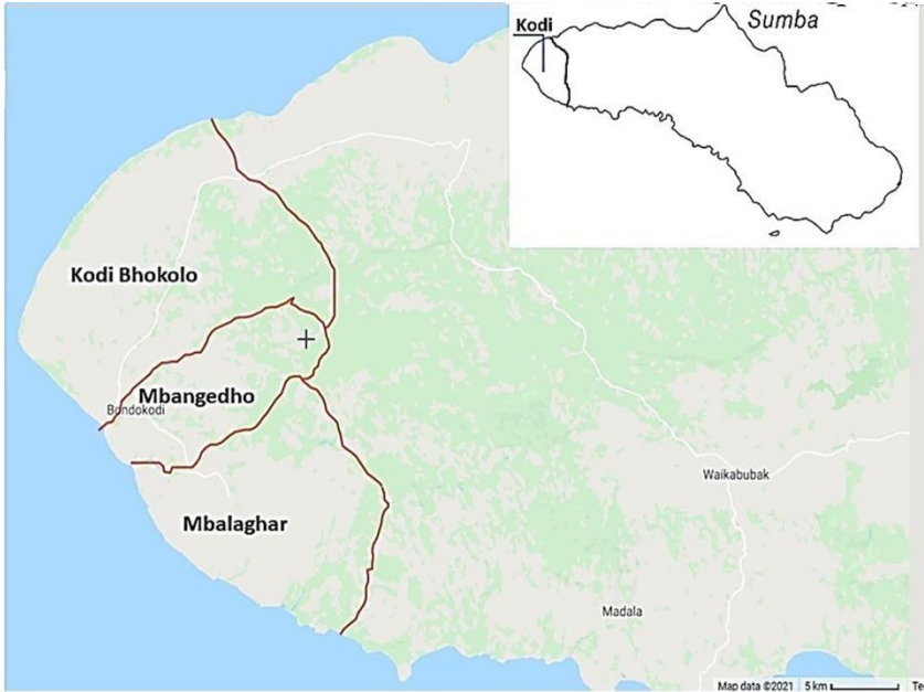
Figure 1. Kodi Bhokolo, Mbangedho, Mbalaghar locations 3

Kodi society is primarily made up of subsistence farmers who use the land in three ways: ‘as garden ( mango ), as fallow plots ( ramma ), and as pastures for livestock ( marada )’ (Hoskin 1993: 6). To meet their daily food needs, Kodi people plant rice and corn in their mango , which is mixed with beans, tubers, chillies, and vegetables. Nowadays to fulfil secondary needs (e.g., education), they mostly cultivate cashew trees for their profitable and abundant nuts. 4 In addition to supplying their food source, farming also fulfils a crucial social function of being a prestige component of the economy (Hoskin 1993). In this sense, the prestige economy relates to the social and economic currency of raising herds of buffalo, horses, and cattle in Kodi society. Other common livestock includes chickens and pigs. This livestock is also raised for sacrifice in Marapu ritualised events 5 such as paholong , woleka ‘ceremony feast’, and