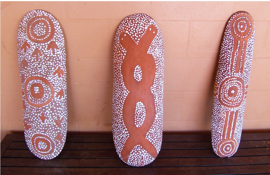
Figure 2: During the late afternoon before the Kurdiji ceremony. The fathers of the initiation candidates paint shields with the Dreaming designs for which their sons have inherited ownership. These shields are later used in the ceremony.