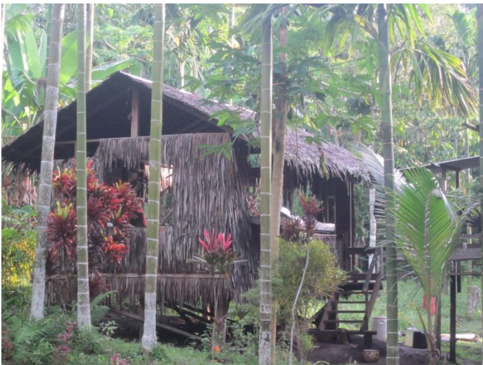
Figure 3: A kitchen building made from sago leaves