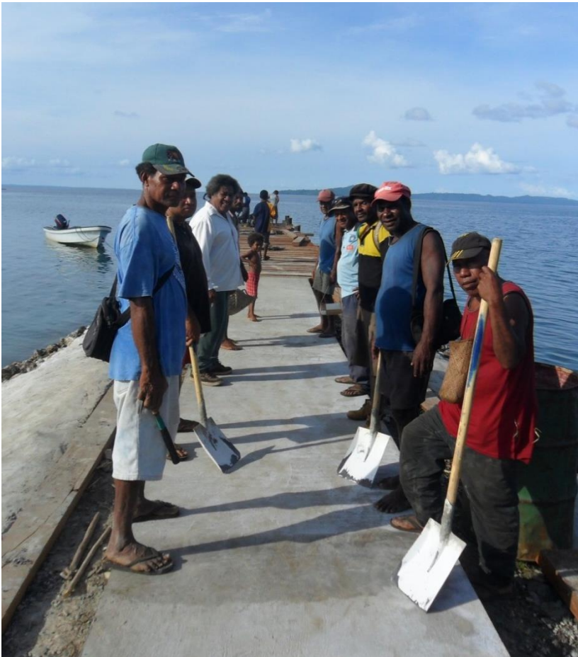
Figure 7: Communal work: building a new jetty

Paluai is an Oceanic language of Papua New Guinea that is vibrant and actively transmitted intergenerationally, unlike many indigenous languages of Papua New Guinea. Despite this, it is under threat from Tok Pisin and to a lesser extent English. Code-switching is pervasive, and the language has very little institutional support in the form of written materials, or systematic use in educational contexts. It shows signs of severe endangerment in domains where it is most closely linked to more traditional elements of the culture it is embedded in, such as the special register used for chanting, or the kinship terminology.