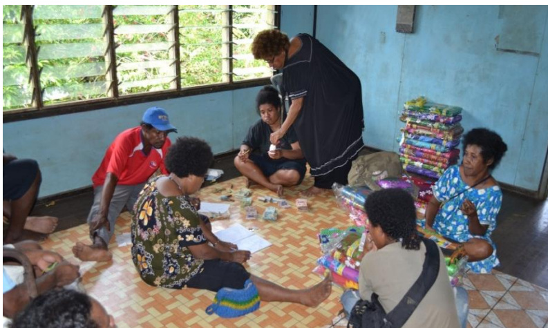
Figure 6: Redistributing the amounts of money and gifts collected from various groups at a pailou ceremony after a death