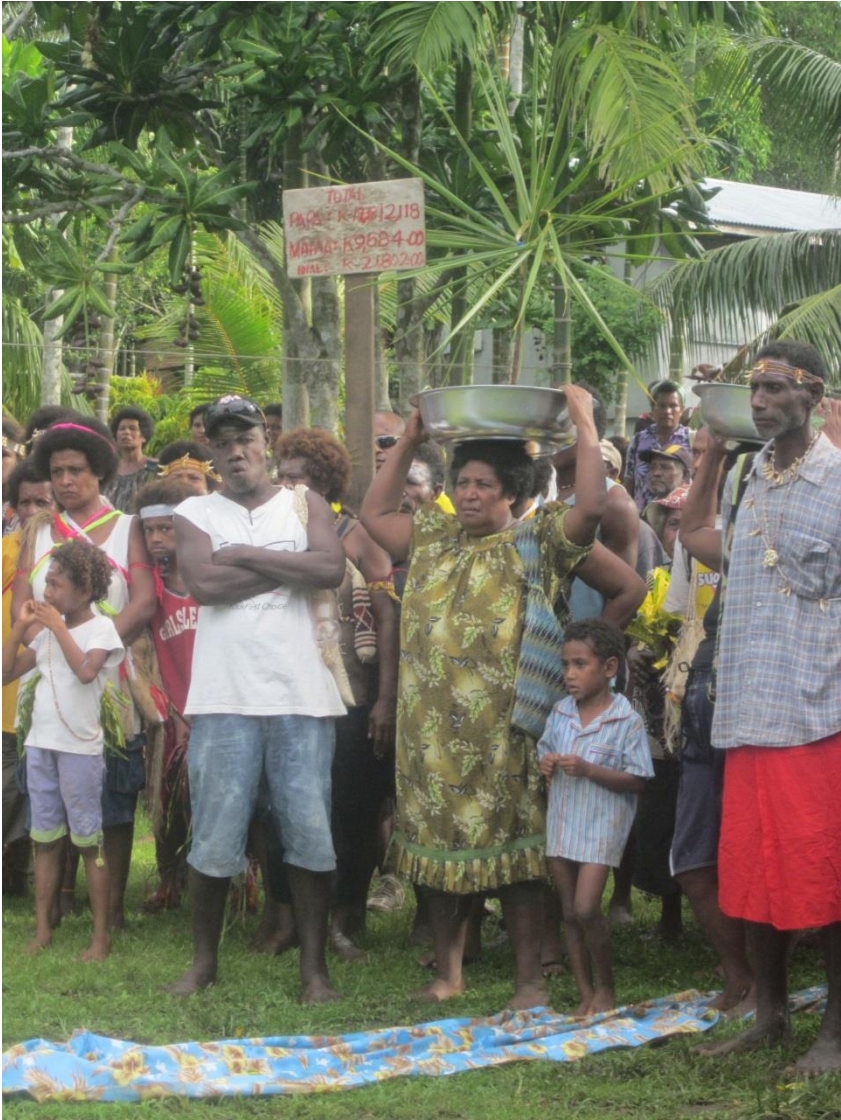
Figure 5: Sign making the announcement of the amounts of money collected from the father's and mother's side for a bride price