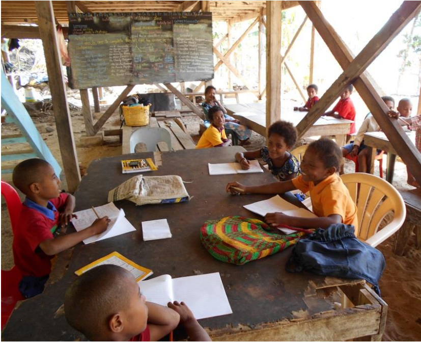
Figure 4: Pumbanin primary school