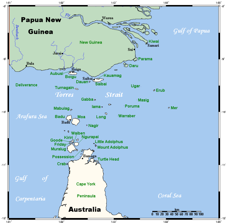
Figure 1: Torres Strait Islands situated between Papua New Guinea and Australia

Wara in kedha, gimal 85% Torres Straitalgal Australiaw dhawdhaynu nipa. Saibailgal koeyma Cairnsuenu a wara Townsvillanu nipa. Dhuray Brisbaneninu. Saibaigal Saibainu, Bamaganu, Seisianu a Australiaw dhawdhaynu thana yapa ridhpoelaypa moegaw gasampa.